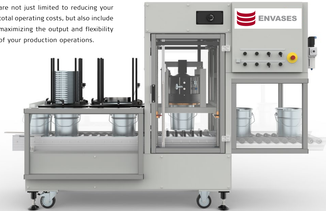
Combination system for 230 and 328 mm

The advantages behind TOP EXPAND are not just limited to reducing your total operating costs, but also include maximizing the output and flexibility of your production operations.