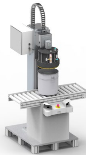
System with two-hand control – the alternative for smaller volumes.